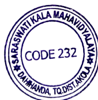
In- Principal Saraswati Kala Mahavidyalaya, Dahihanda, Tq. Dist. Akola